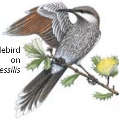
Western Wattlebird on Dryandra sessilis