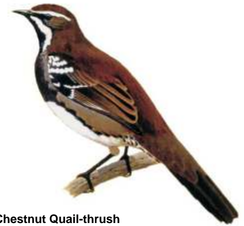
Chestnut Quail-thrush P Marsack

Number 35a in a series of Bird Guides of Western Australia