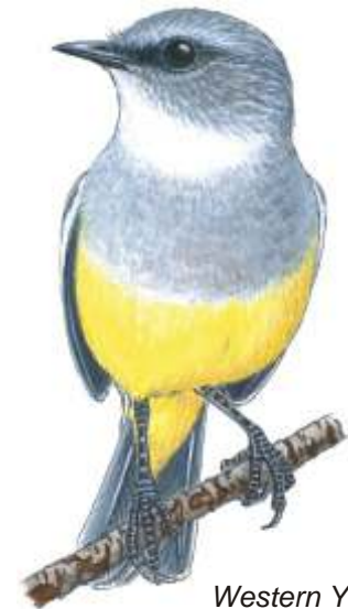
Western Yellow Robin

Number 27a in a series of Bird Guides of Western Australia